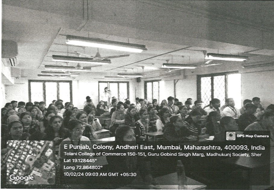
The learners of the Bachelor of Management Studies programme listening to the interactive session.

Tel. : (022) 6153 5455 Fax : (022) 6153 5456 E-mail : tcc@tolani.edu Website : tcc.tolani.edu