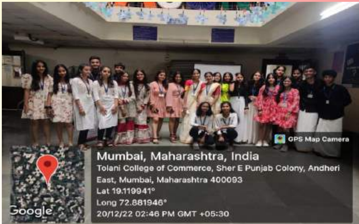
Twin day organised during Students' Council week