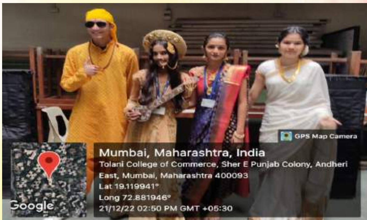
Bollywood day organised during Students' Council week