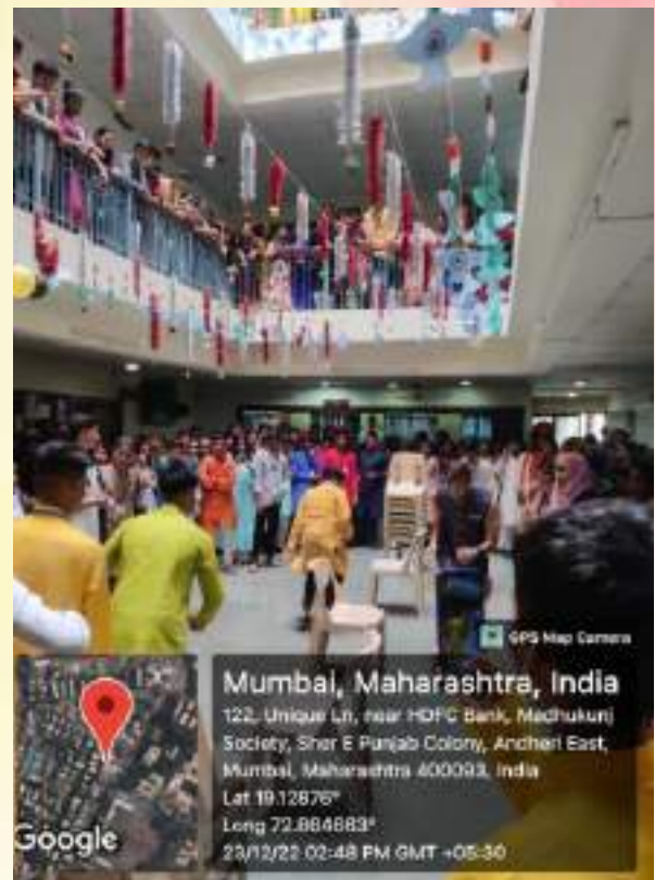
Fun games organised during