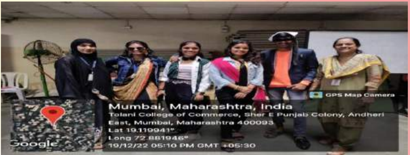
Mismatch day organised during Students' Council week