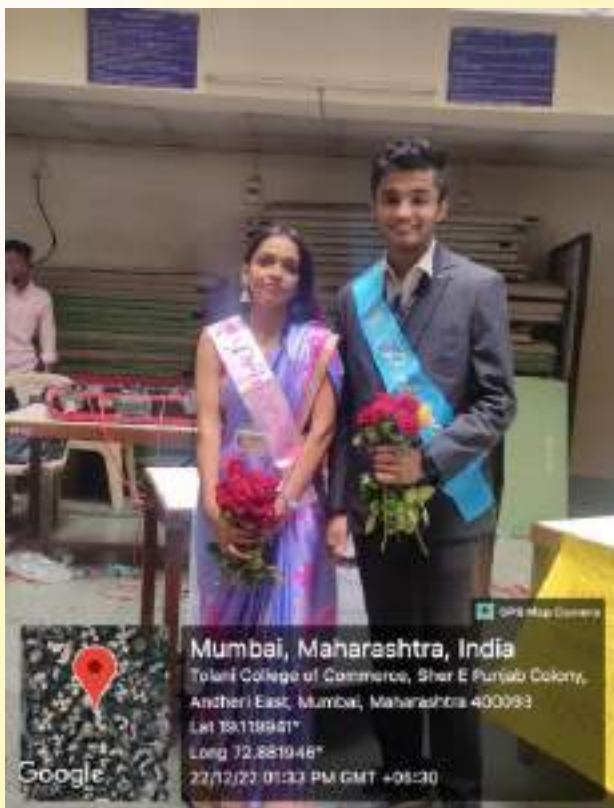
Rose Prince and Rose Princess declared during Raazmatazz