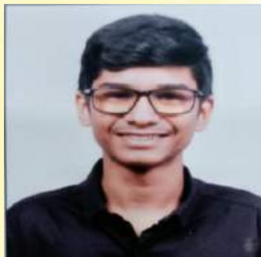
Nihar R. Lotekar (Cover Design)

Not only the students, but teachers and staff also participated in the sports events.