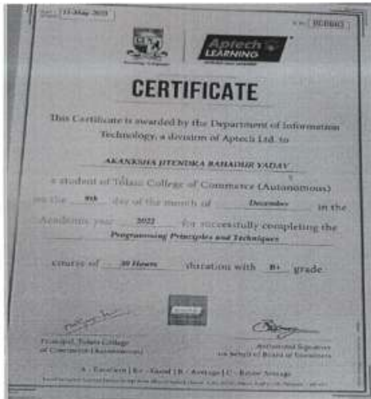
Certificate of learners who have successfully completed the course

Tel. : (022) 6153 5455 Fax : (022) 6153 5456 E-mail : tcc@tolani.edu Website : tcc.tolani.edu