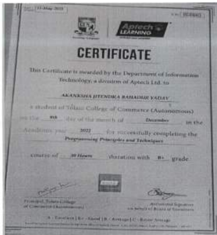
Certificate of learners who have successfully completed the course

Tel. : (022) 6153 5455 Fax : (022) 6153 5456 E-mail : tcc@tolani.edu Website : tcc.tolani.edu