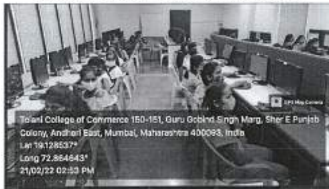
Children undergoing practical training session