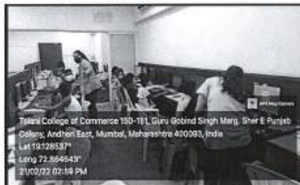
Learners guiding the community children during a training session