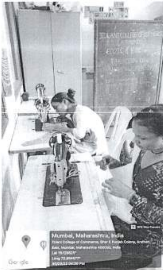
The women using the tailoring machine