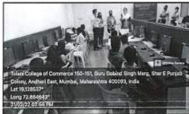
Computer training session in Computer Lab